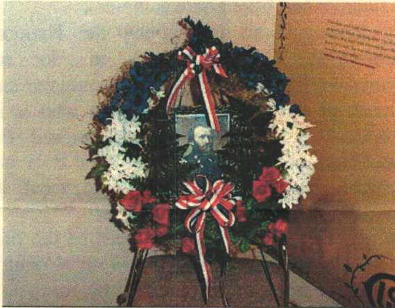
Ulysses S. Grant Memorial Wreath