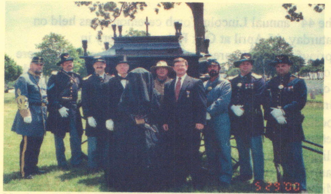
Members of Ulysses S. Grant Camp #68, SUVCW and Sterling Price Camp #145, SCV with restored 19 th century hearse.