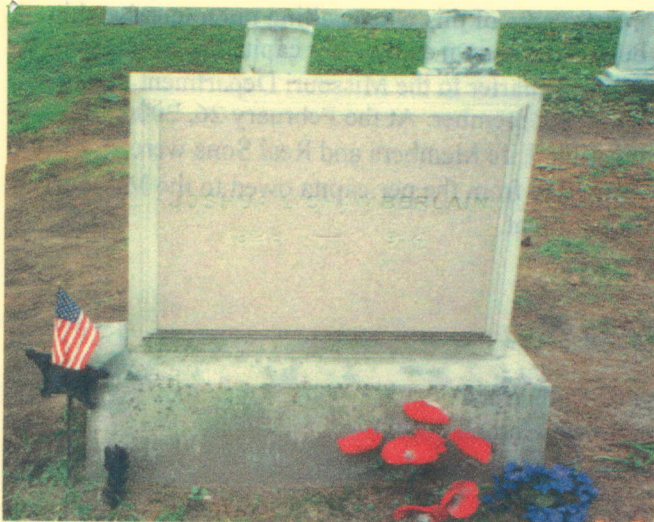
The grave of General Chamberlain at Pine Grove Cemetery in Brunswick, ME.