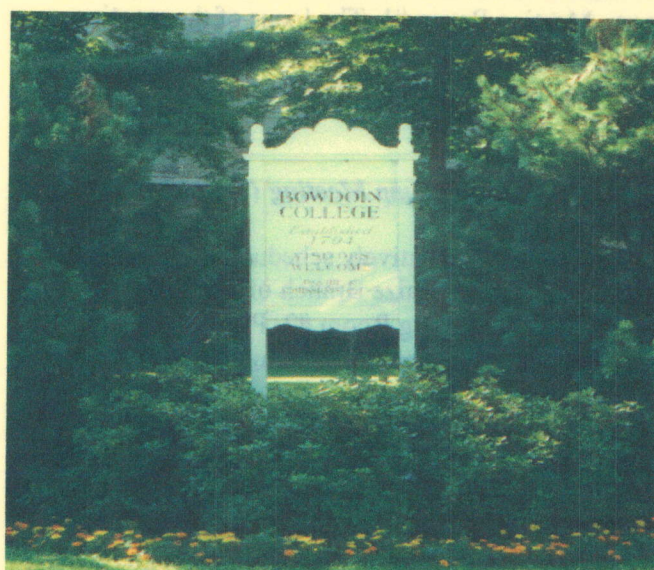
Across the street from Chamberlain's home is Bowdoin College, his alma mater.