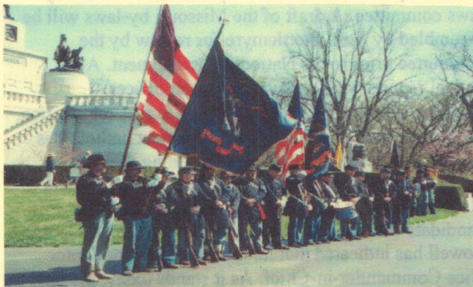
(Above Photo) - Color guards present at the 44 th annual Lincoln Tomb ceremony