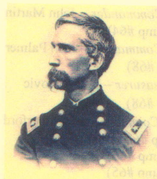
Bvt. Major General Joshua L. Chamberlain