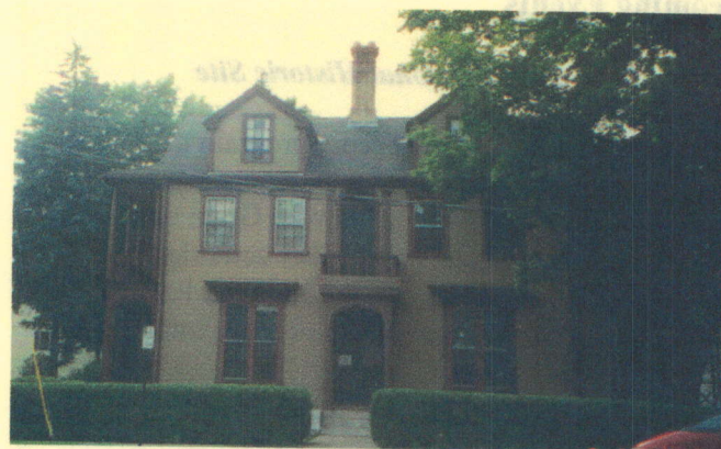
General Chamberlain's home currently under restoration to look as it did in the 1870's.