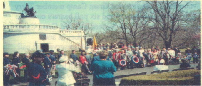
Gathering of organizations presenting wreaths at the Lincoln Tomb