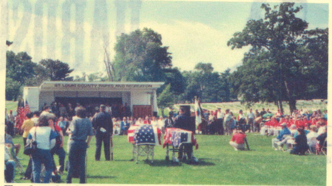
Flag-draped casket honoring veterans of all wars (left) and coffin draped in 34-star U.S. flag and Confederate battle flag (right) symbolic of the first Memorial Day observances.