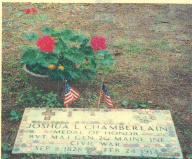
Behind Chamberlain's tombstone is the Government issue stone that signifies his military service.