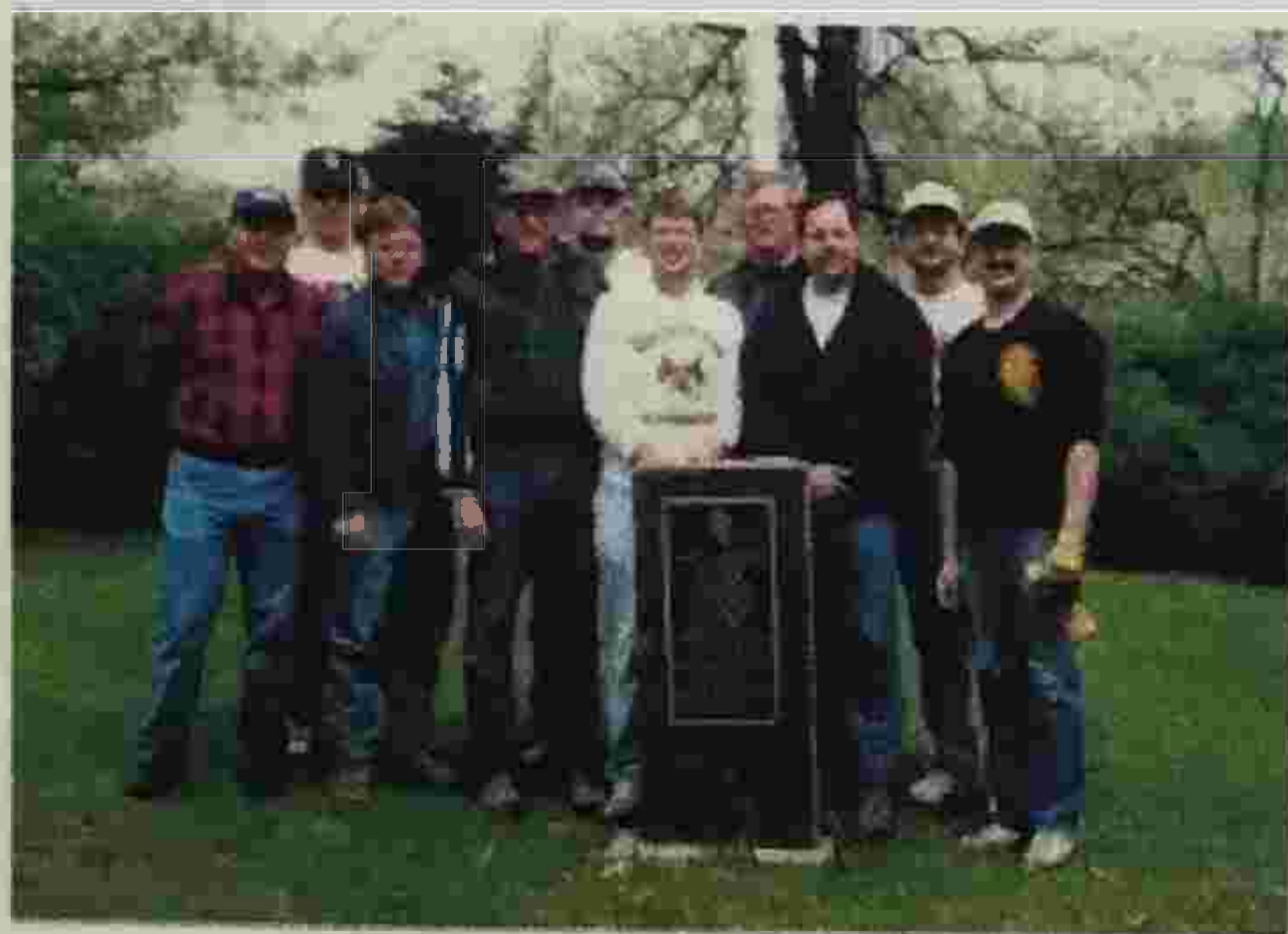
Members of the Sterling Price Camp SCV and the U. S. Grant Camp SUCVW

Volume 2 No. 3. November 1999 Editor: Steven Leicht