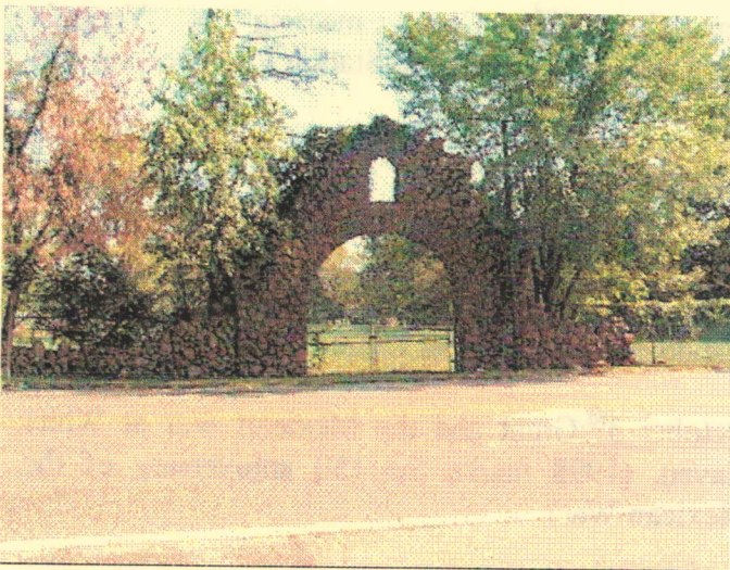
Stone Gate at Gravios and Grant Rd.