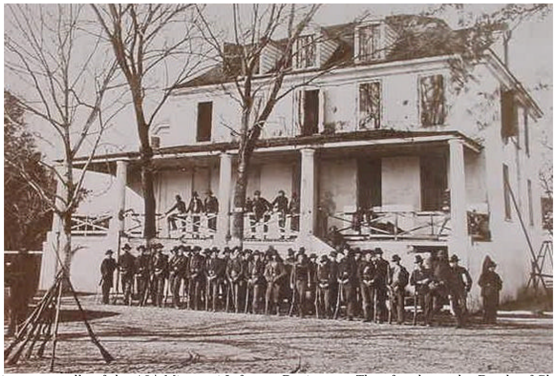
Photo is supposedly of the 18th Missouri Infantry Regiment. They fought at the Battle of Shiloh, TN.