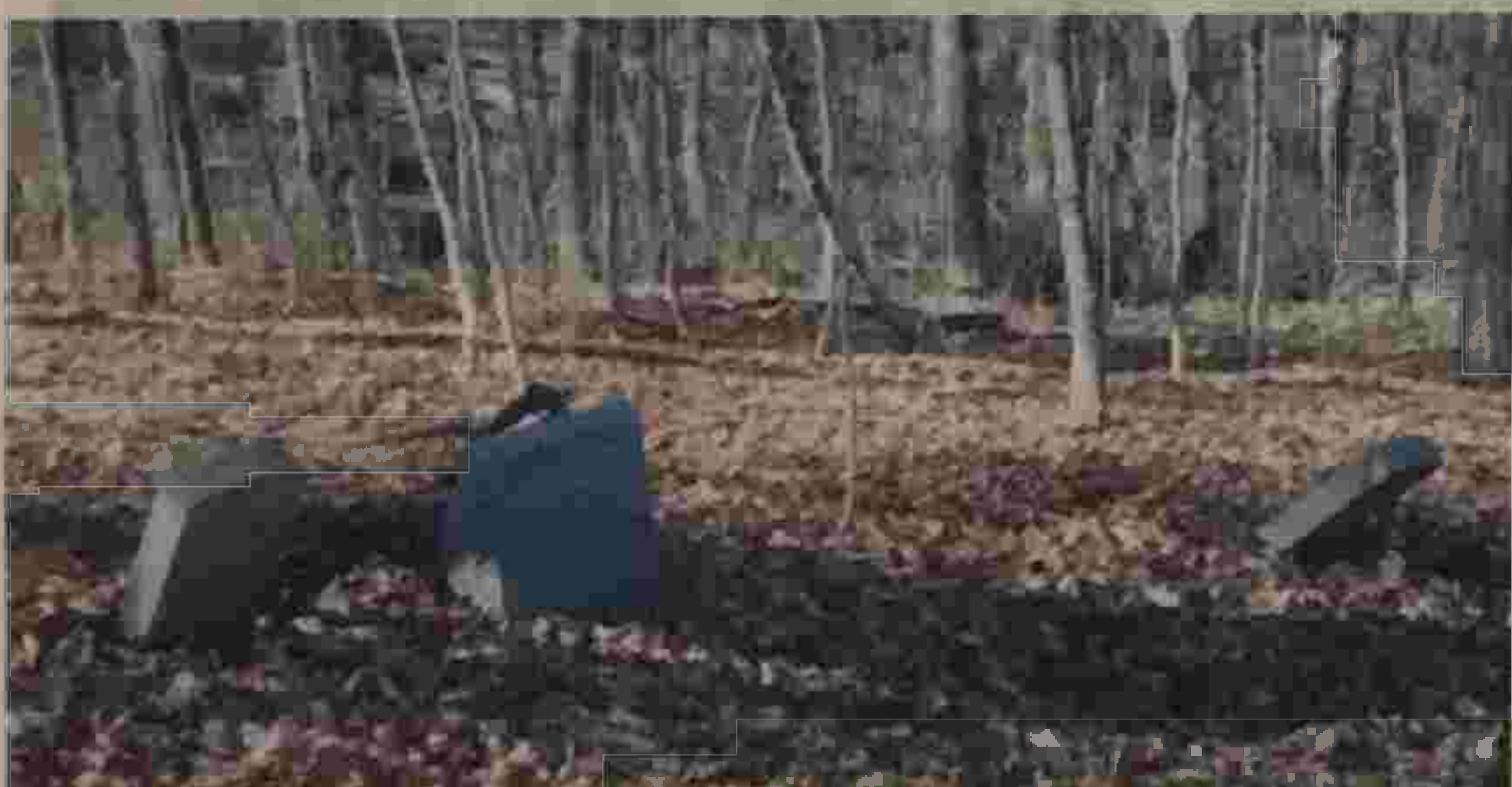
Graves of Union veterans (extreme left and right) at Mount Pleasant African Baptist Church Cemetery in Wildwood, MO.