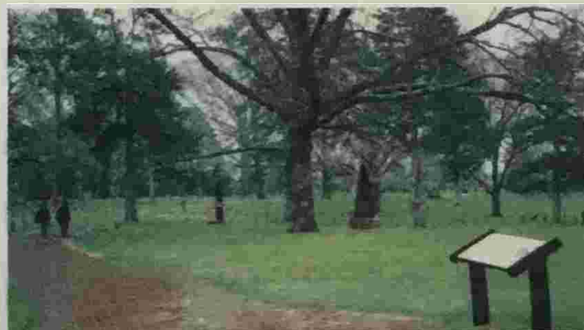
The National Cemetery at Shiloh National Military Park.

Shiloh National Military Park is located just south of Savannah, TN on Hwy. 22. The park was established in 1894 and spans over 3500 acres. Visitors can view a 25-minute film about the battle at the Visitors Center and both driving and hiking tours of the battlefield can be taken. The driving tour contains 14 stops at key locations on the battlefield. About 15 miles of hiking trails are available for those who are interested in some of the detailed history of the battle.