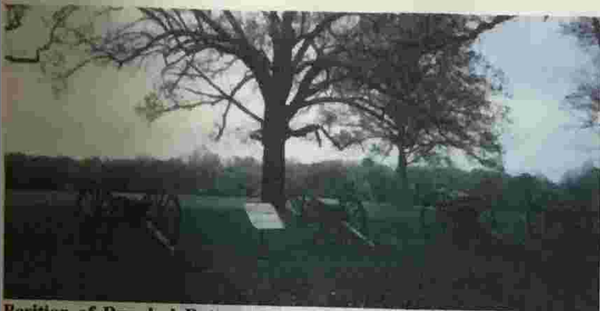
Position of Ruggles' Battery – a total of 62 guns fired on the Union position across the field at the Sunken Road.