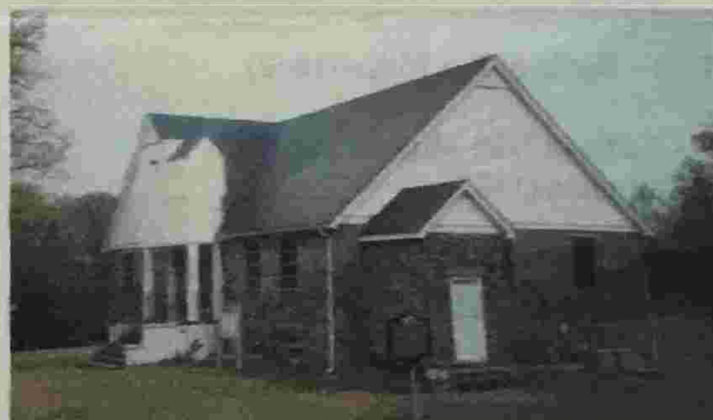
(Above) The Shiloh Church, from which the battle took its name. The current structure was erected in 1949 – only a small portion of the original structure remains. (Below) The Sunken Road – the final line of Union defenses at the "Hornets Nest".