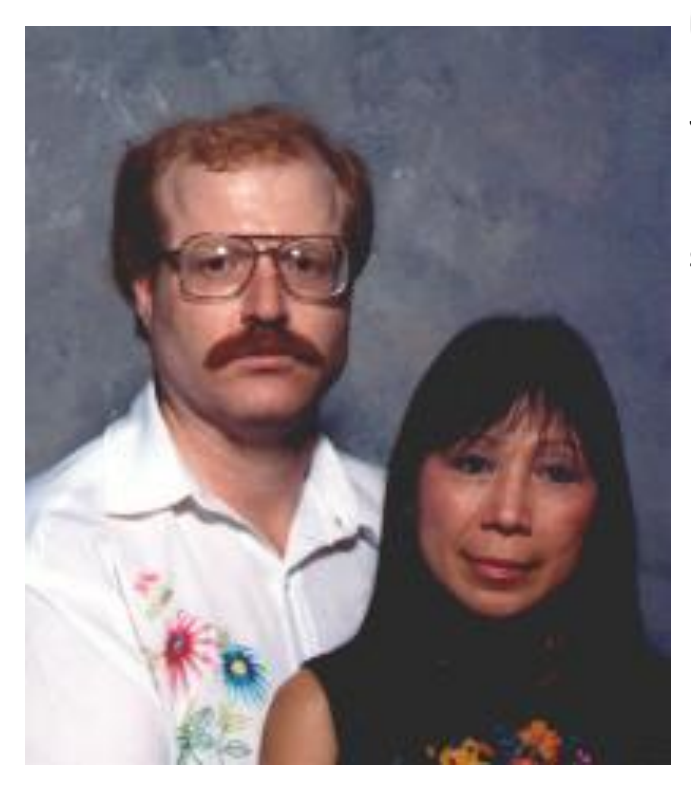
nieces as well as 5 step-brothers. A lover of art, music, trivia, food and gregarious in life.

He attended technical post graduate school and became a hospital lab technician in Doniphan and Troy, Mo. Later he worked in delivery helping his step-father in the meat wholesale business. He also worked at St Louis Lithographing before